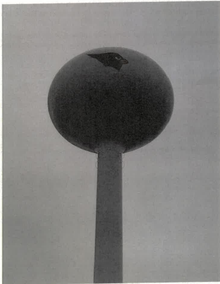
500K Sph - Mayville